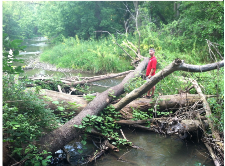
Target areas for clean up this year during the Pike River Revival

The primary goal of this project is to remove debris, including log jams, that prevent the natural flow of the river. With additional goals of increased water quality, safety, riverbank preservation, beautification, and recreation. This is the river where the KSFCA / WDNR salmon stocking occurs each year. Unfortunately when the fish return to spawn they face too many obstacles to be successful. (Two examples are shown in these photo's). With the upcoming decline in target stocking levels in the Lake Michigan fishery, it becomes even more important that as an organization we do whatever we can to provide natural spawning opportunities for these fish.