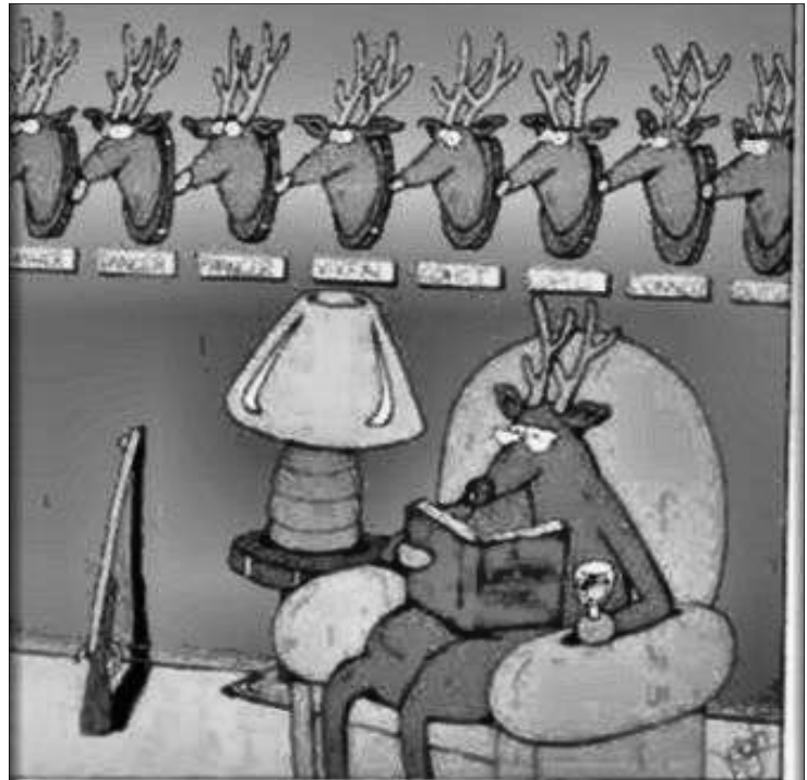
All the other reindeer used to laugh and call him names.

or See Our Sporting Logo gear for hunters and fishermen. Join in and submit to Outdoor Wild