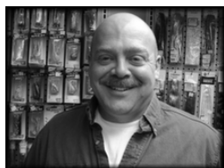
Owner of Harborside Bait & Tackle

Just a quick note to let everyone know that there are still fish being caught in the harbor, Pike, and the Root. Plenty of Steelhead in the Root along with some Cohos. I'm sure there are also some Kings still around. Actually there are still Kings in all three locations. In the harbor, Browns are now the majority.