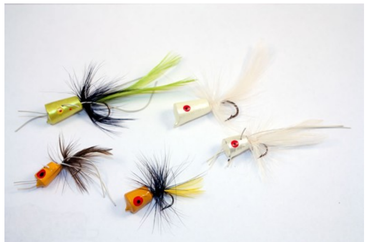
Soft foam popper examples