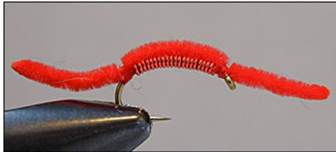
San Juan Worm example

be the soft foam popper. The series will continue on Tuesdays through March 25th, 2014. These classes will include many fly variations including many different UV2 patterns, ice fishing flies, Lake Michigan trolling flies, minnows, frogs, crayfish, grasshoppers, and crickets. These classes are free to club members and youth between the ages of 8 and 14 when accompanied by and adult. There will be a minimal charge for all others.