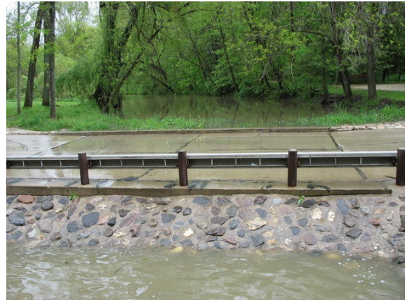
The damn at Petrifying Springs (May, 2006)