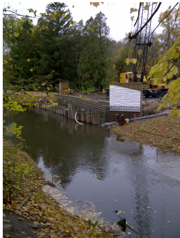
Construction of the new bridge (October, 2012)