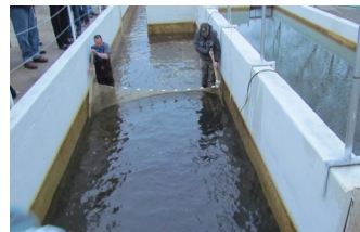
After the water level was dropped the fish were pushed, or guided to the point of release into the Pike River.