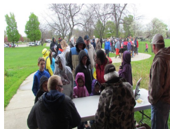
Waiting for checkin, before 9:00 am