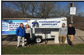
Some of the students from Harborside Academy who participated in the project