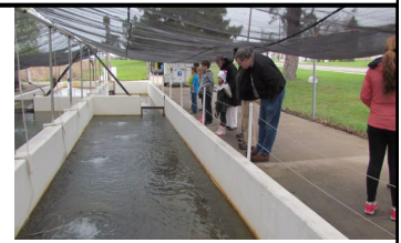
Observing the fish in Section #3 of the KSFCA Rearing Pond