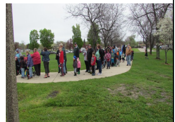
...And the line goes on