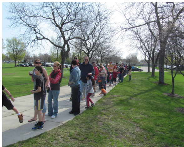
Kids waiting to check in at annual event

Kids Fish N Fun held on Saturday, May 10th (continued from page 1)