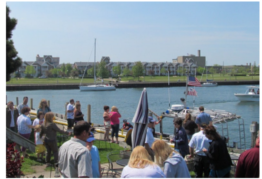
Crowd in attendance