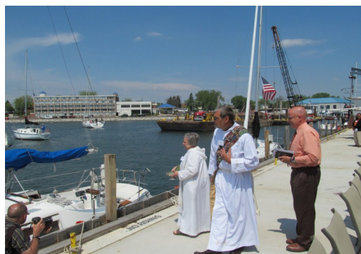
Blessing of the boats