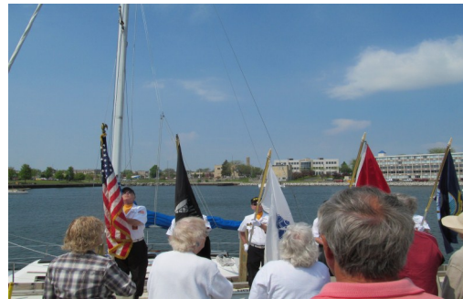
Flag ceremony done by the Kenosha Area Vietnam Veterans