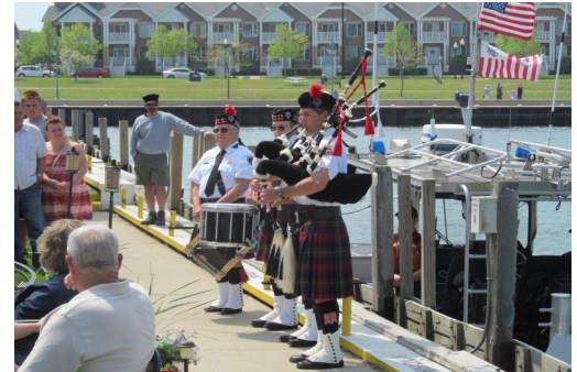
Kenosha Pipes and Drums perform Amazing Grace