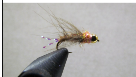
CDC Enhanced Pink Squirrel