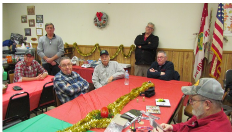
“Eyes on Kips’ tying demonstration”