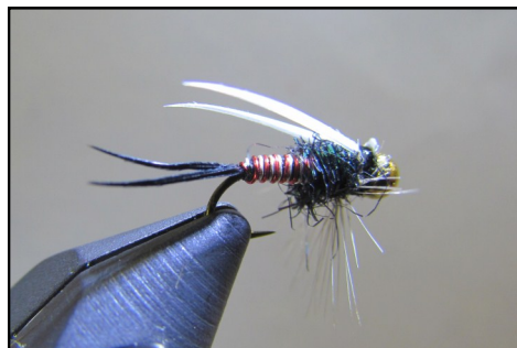
Hot Wire Prince Nymph