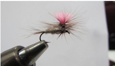
A variation of the “Parachute Adams” tied by “Kip”

The next edition of this publication will cover the flies to be tied during March.