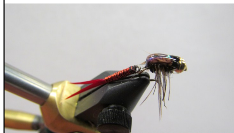
Articulated Copper John