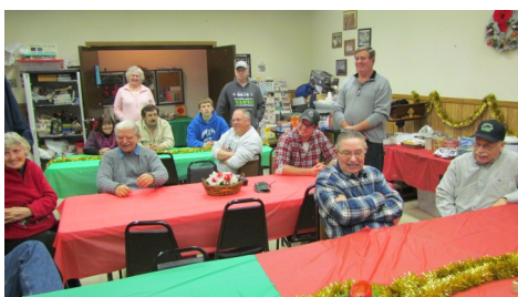
Some of the Tiers & Guests in attendance at the Fly Tiers Party, just before the feast