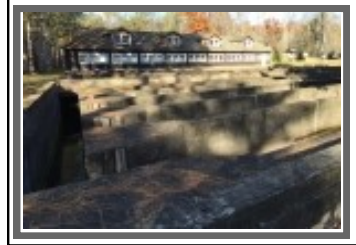
(fish hatchery to close in marinette county, photo #4)