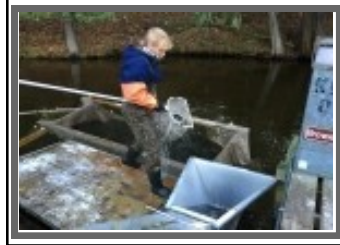
(fish hatchery to close in marinette county, photo #2)