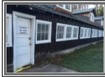
Thunder River Fish Rearing Station to close permanently, Oct. 25, 2016

Any future plans for the facility are unknown.