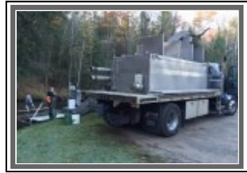
(fish hatchery to close in marinette county, photo #1)