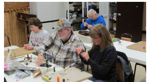
A learning experience with “Kip”