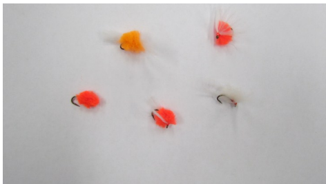
Variations of the nuke-egg-fly-pattern

The next edition of this publication will cover the flies to be tied during January.